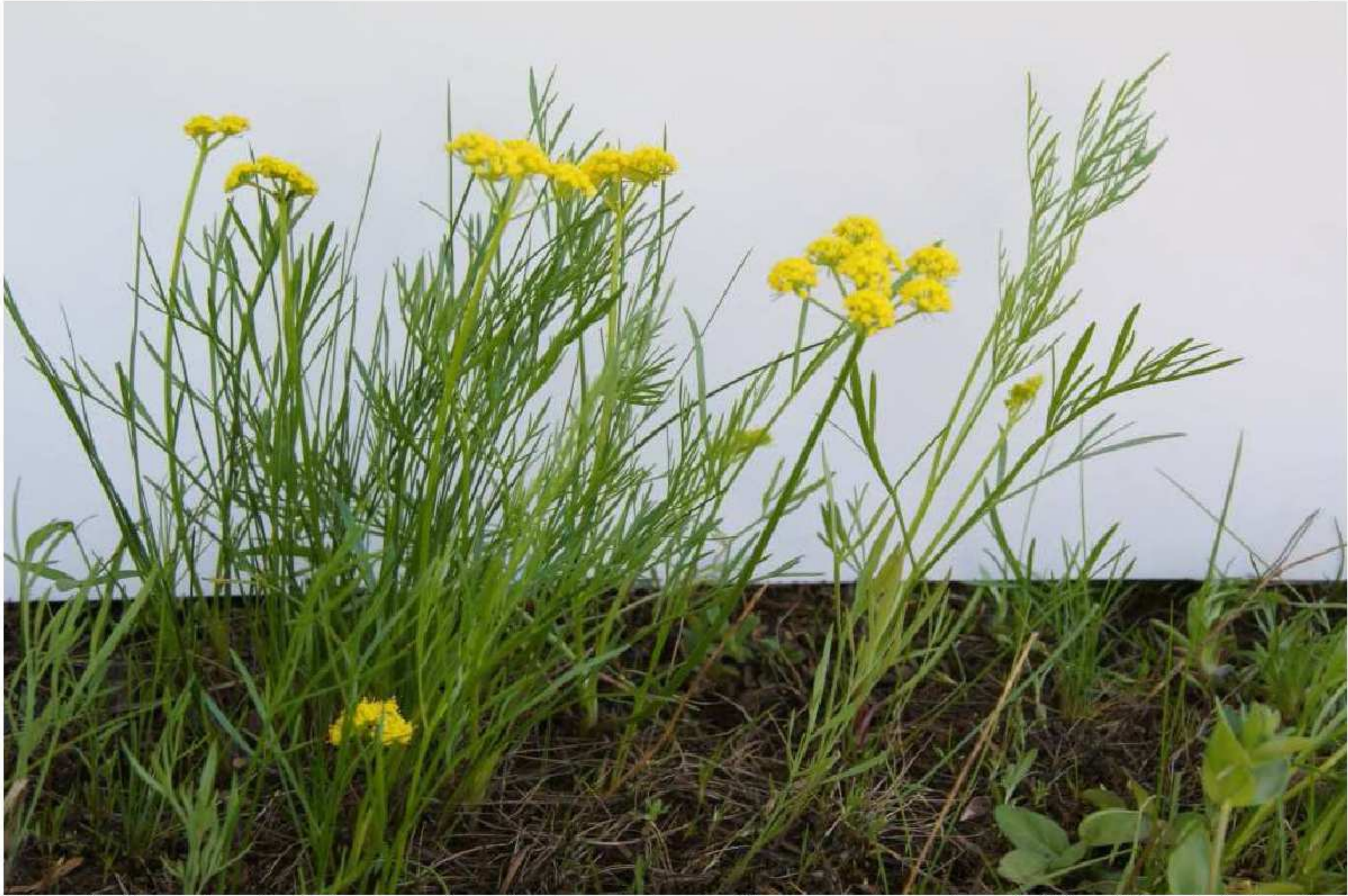
Figure 7. Lomatium knokei mature plants in situ at anthesis. Plants are approximately 20 to 25 cm in height in this view.